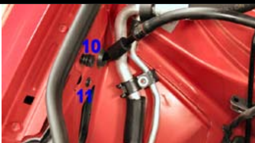
8. Remove the plastic clips (10). Remove the screw (11).