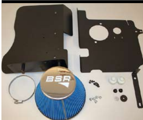
1. Material overview.

Check hoses for deformations, cracks or other leakage. The clamps should be in good condition or to be replaced. Please note, when fitting BSR air filter, do not tighten the air filter to hard, be gentle. Check before and after testdrive that everything are tight and firm.