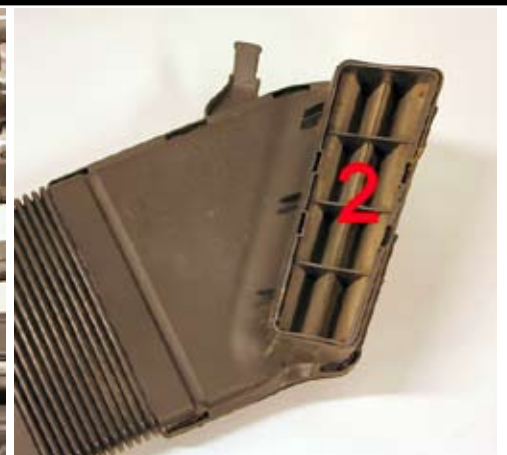
3. Remove the filter from the inlet pipe(2).