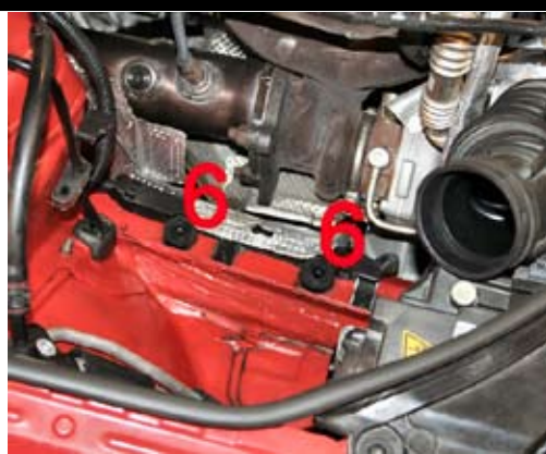
6. Use the original rubber bushings (6) when mounting the shield.