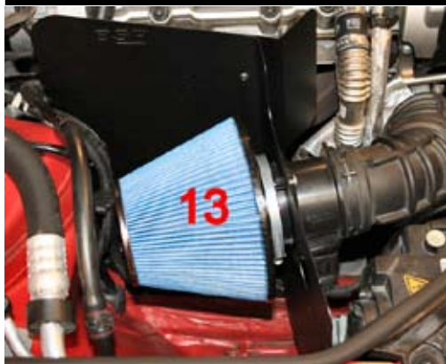
10. Assemble the sport air filter (13), tighten very easy. Just so it does not fall off.