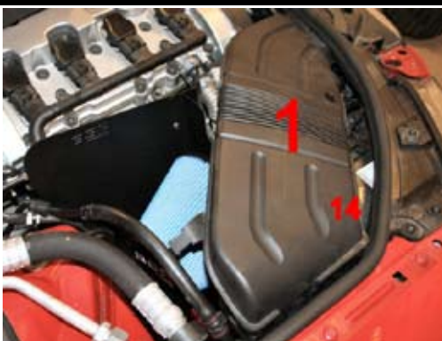
11. Assemble the inlet pipe (1). Push the inlet pipe down easy against the plate (14). Enjoy.