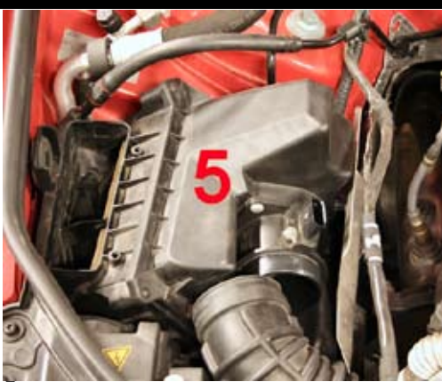
5. Remove the air box from the car (5), then remove the MAS from the air box.