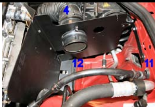
9. Assemble the plate. Fit the plates steering pins in the rubber lead throughs. Assemble the intake hose (4) to the MAS, and the rod/bracing to the chassi (11), use original screws. (Put the rubber washer between the rod and the chassi.) Assemble the electrical harness (12). Use original clips and fasten to the heatsield.