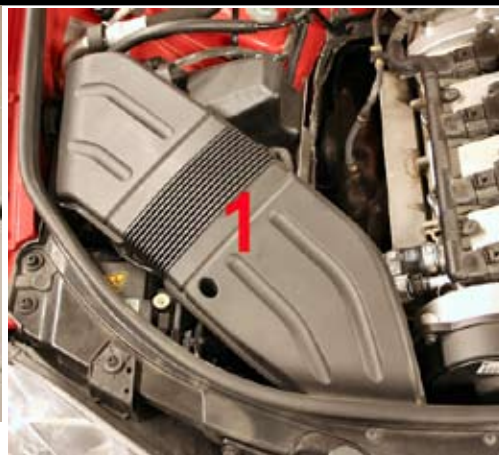
2. Remove the inlet pipe (1).