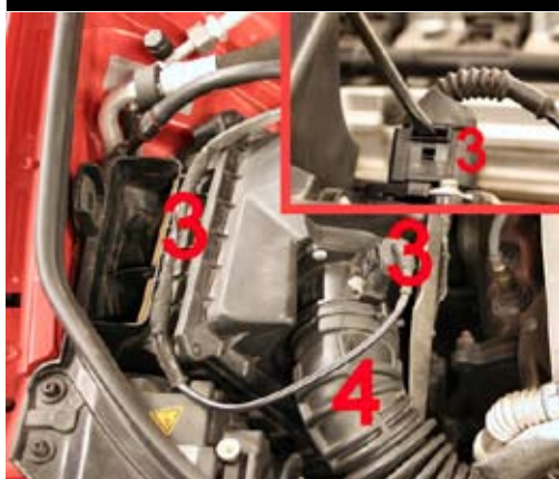
4. Remove the electrical harness (3) from the air box. Use screwdriver as shown to remove the harness plug. Remove the intake hose (4) from the MAS (Mass air sensor).