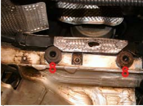
6. Use the original rubber bushings (8) when mounting the shield.

pipes at the same time for an easy liftup.