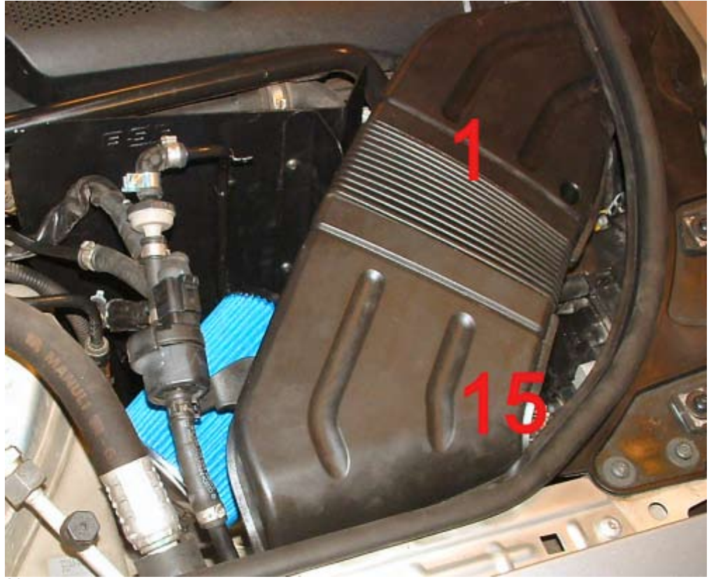
12. Assemble the inlet pipe (1). Use the cut on the shields upper side (15) to attach the inlet pipe.

sport air filter (14). Tighten the hose clamp gently.