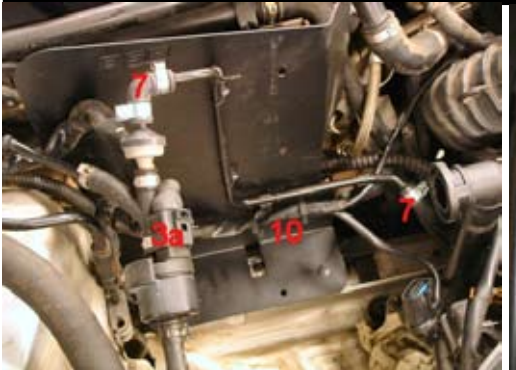
9. Assemble the heat shields: Start with shield A (pic 7). press down the shield as picture shows, make sure the steering pins under the shield hits the rubberbushings (8, pic 6). Attach the harness to the clips (10), and the hoses to the EVAP-pipe (7). the original screw. Place the rubber washer Use new hose clamps. Attach the harness plug and bushing beetwen the rod and chassie (11). to the EVAP-valve (3a).