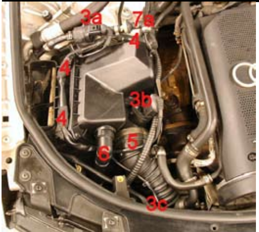
4. Remove the electrical harness from the air box: Remove the harness plug from the EVAP-valve (3a), air mass meter (3b) and the magnetic valve (3c). Remove the clips (4) from the harness. Remove the intake hose (5) from the air mass meter, and the secondary air pipe (6) from the air filter box. Remove Then easily pull it up until it releases from the and discard the upper hose clamp (7a) from the EVAP pipe and loosen the hose. (The EVAP pipe is attached to the air filter box, under the heat shield.