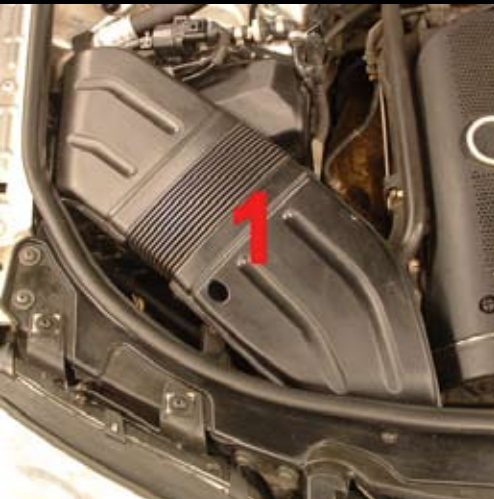
2. Remove the inlet pipe. (1).