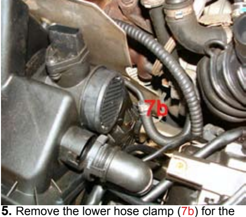
EVAP-pipe and loosen the hose. Remove the air filter box: First remove the air box from the upper attachement at the inner side fender.