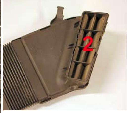
3. Remove the filter from the inlet pipe. (2).