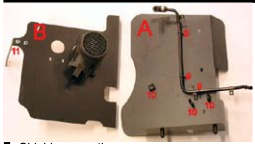
7. Shield preparation:

Attach the air mass meter and the EVAP-pipe to the heat shields. Assemble the EVAP-pipe to shield (A) with the 3 tie wraps, attach points (9). Assemble the clips (10) and the rod (11).