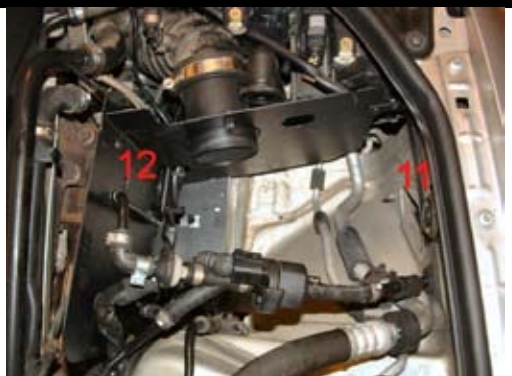
10. Attach shield B to shield A, use the M5 screws and nuts, put the pipe and harness threw the hole (12). Attach the intake hose to the air mass meter, tighten the hose clamp. Attach the rod (11) to the inner side fender with