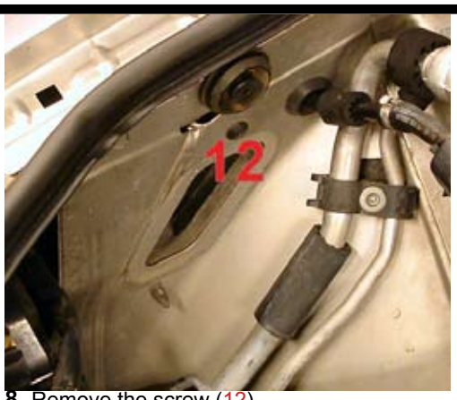
Remove the screw (12).

Attach the air mass meter and the EVAP-pipe to the heat shields. Assemble the EVAP-pipe to shield (A) with the 3 tie wraps, attach points (9). Assemble the clips (10) and the rod (11).